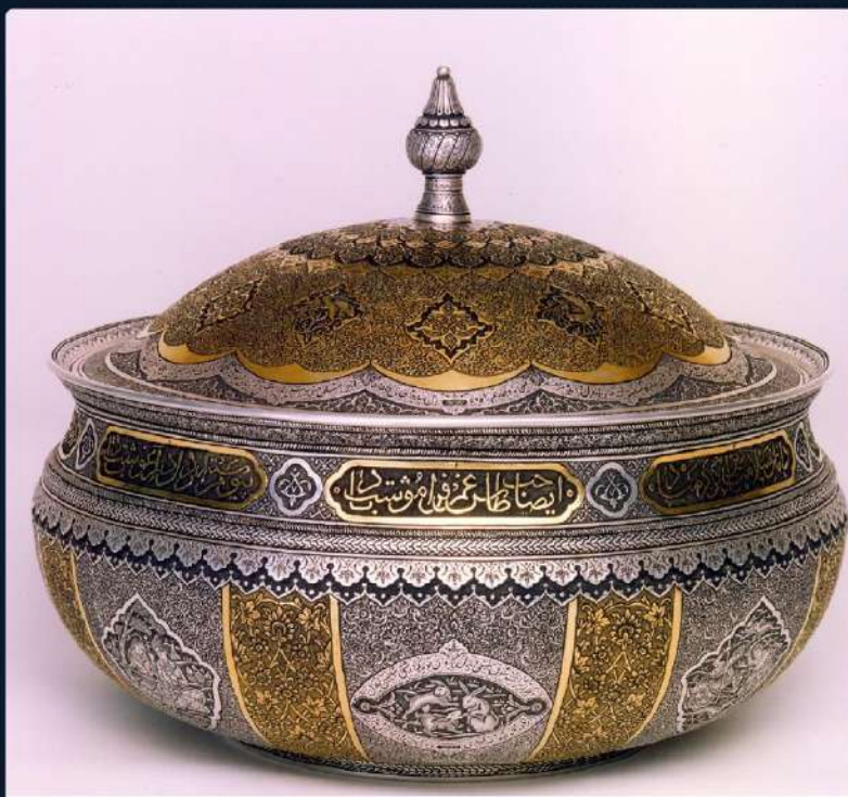
Persian engraving (ghalam-zani)