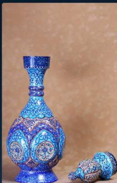
Persian Enameling (Mina-kari)