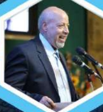
Abbas Rezaei Governor of Isfahan