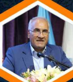
Ghodratollah Norouzi Mayor of Isfahan