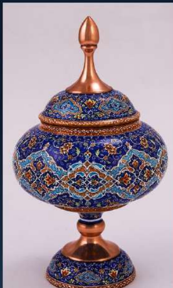
Persian Enameling (Mina-kari)