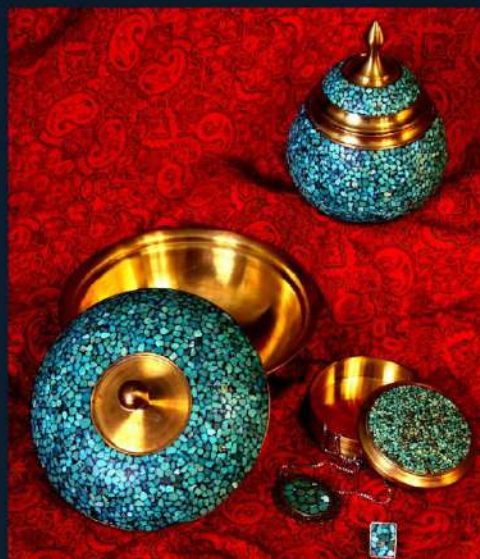
Turquoise Inlaying (Firoozeh-Koobi)