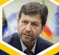
Mehdi Jamalnejad Deputy Minister of the Interior